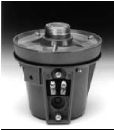
PD-30 / PD-30-16