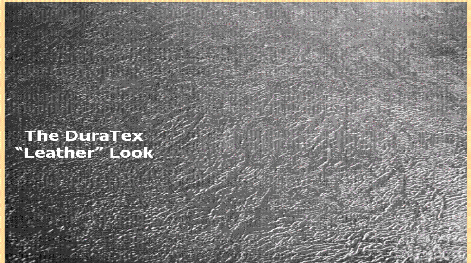
The DuraTex "Leather" Look

Creating cabinet textures can be a real challenge when using delicate equipment such as pressure pots and HVLP guns. Airless equipment is expensive and less sophisticated application techniques can fall short of a professional look.