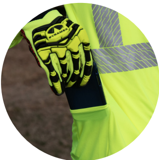
Cell phone pocket