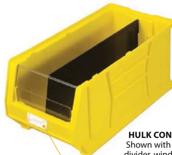
HULK CONTAINER Shown with optional divider, window front, adhesive label holder and insert

AL-23 2" x 3-1/2" Adhesive clear label holder & inserts. Package of 24 (Sold separately)