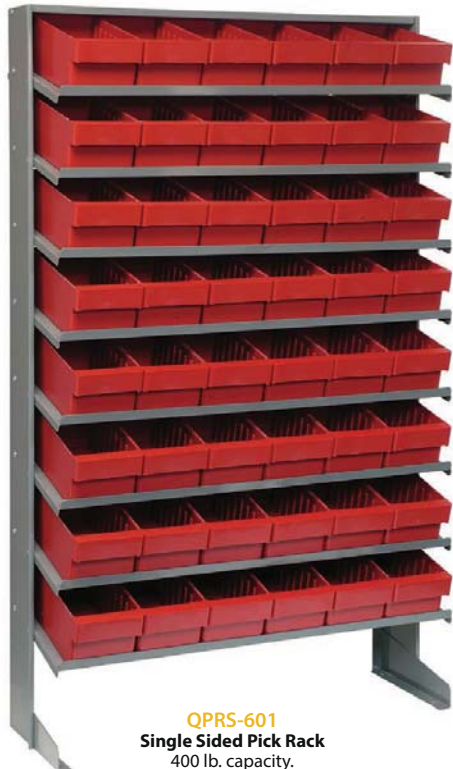
QPRS-601 Single Sided Pick Rack 400 lb. capacity.