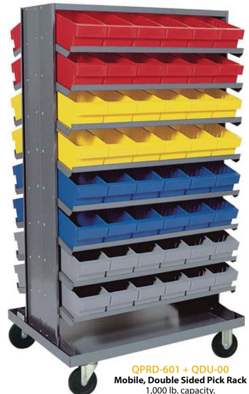
QPRD-601 + QDU-00 Mobile, Double Sided Pick Rack 1,000 lb. capacity.