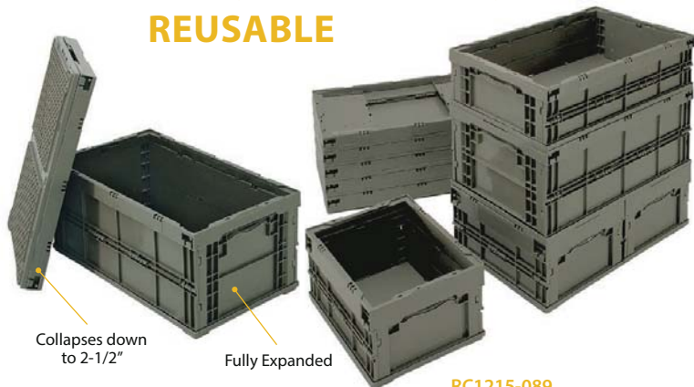
RC2415-075 RC2415-111 RC2415-089