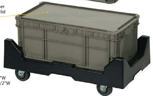
DLY-2415 Interior Dimensions 24"L x 15"W Exterior Dimensions 28"L x 18-1/2"W