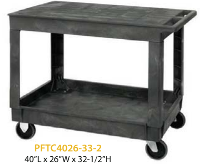
PFTC4026-33-2 40"L x 26"W x 32-1/2"H