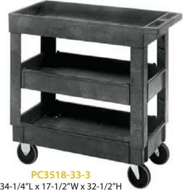
PC3518-33-3 34-1/4"L x 17-1/2"W x 32-1/2"H