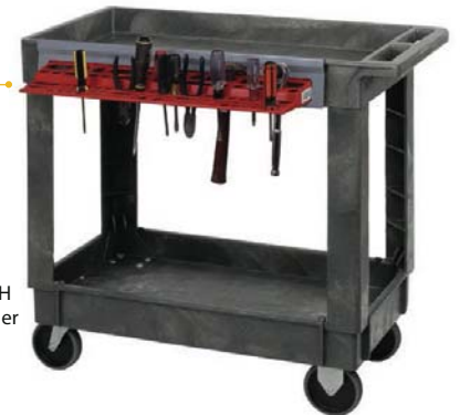
PC3518-33 + PCTH 34-1/4"L x 17-1/2"W x 32-1/2"H Shown with optional Tool Holder (Tools not included)

Shown with optional Tool Holder Attachment