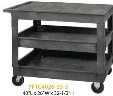
PFTC4026-33-3 40"L x 26"W x 32-1/2"H