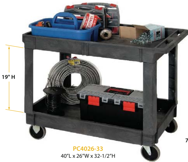
PC4026-33 40"L x 26"W x 32-1/2"H