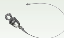
ESD-DC Drag Chain

CONVERT STANDARD WIRE SHELVING INTO CONDUCTIVE SHELVING WITH THESE ACCESSORIES THAT ARE INCLUDED WITH THESE PACKAGES