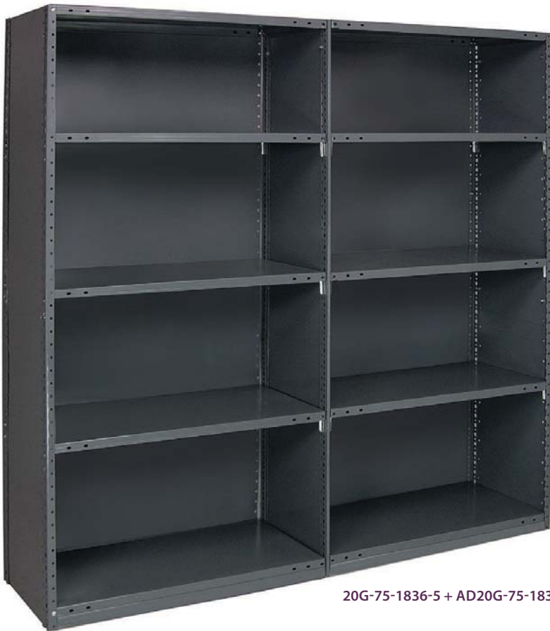
20G-75-1836-5 + AD20G-75-1836-5