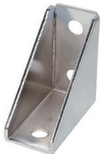
PWB Post Mount Bracket Used to secure cantilever post mount units and free standing shelving units to wall. Sold in a pack of 4. (Mounting Screws are not included)