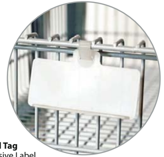
PS-LH3 Hanging Label Tag Fits 1-3/8" x 3" Adhesive Label