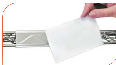
LHE3X5C Label holder extender requires clear label holders listed above. Works with all sizes.

Clear label holder extender with inserts converts 1-1/4"H labels shown above into a 3" x 5" label. Labels can be easily changed or relocated. Laser and inkjet compatible inserts come in 8-1/2" x 11" perforated sheets. Package of 12.