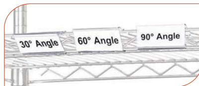
LH3C Top Shelf View