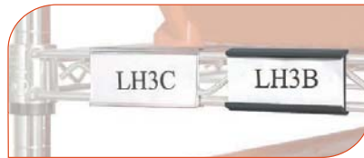
LH3C and LH3B Front Shelf View

Are an excellent method for identifying product. Holders affix directly to truss on any size shelf. (Label inserts sold separately)