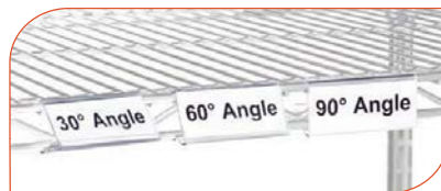
LH3C Bottom Shelf View