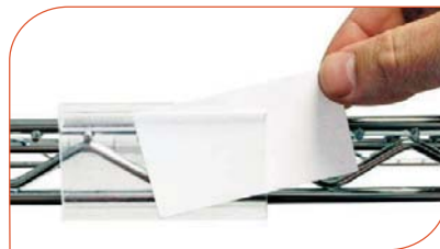
Inserts slide into label holders easily