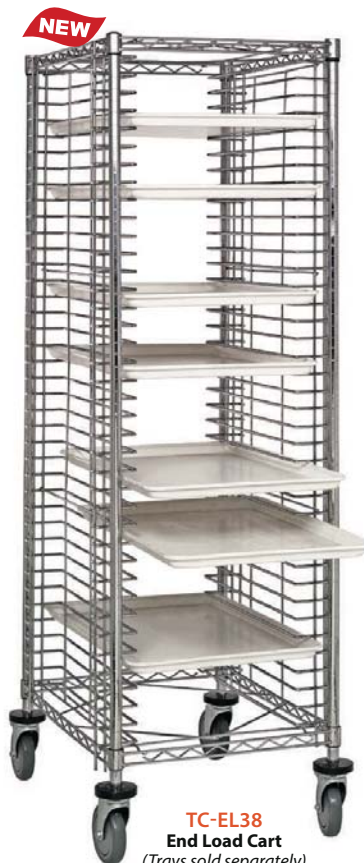
TC-EL38 End Load Cart (Trays sold separately)