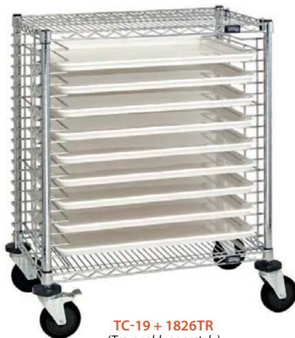
TC-19 + 1826TR (Trays sold separately)