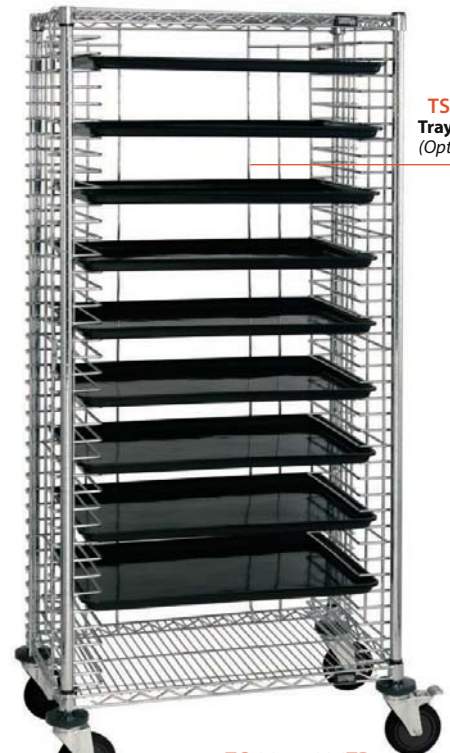
TS62C Tray Stop (Optional)