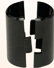
WR-SSCO Plastic Conductive Split Sleeve Sold as a pack of 4 pairs.