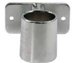
WR-WMB Post Wall Mount Bracket Mounts post to wall securely. 2" clearance required.