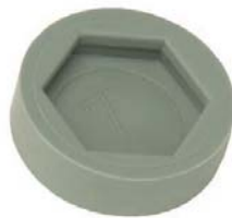
FG Non-Marring Floor Glides Serves as protection to prevent marring of floors. Sold as a 4 pack.