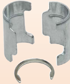
ESD-SS Aluminum Split Sleeve Aluminum Split Sleeves required when grounding standard wire shelving in conductive applications.