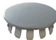
WR-SP Shelf Collar Plug Sold as a pack of 4 pieces.