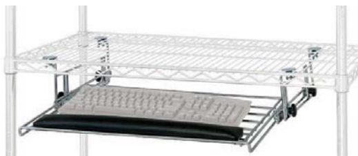
KEYBD Keyboard Shelf

Mounts under any size wire shelf and accepts keyboards up to 21"W x 11"D. Has a 6" height adjustment. Measures 25-1/4"W x 15"D x 4-1/4"H