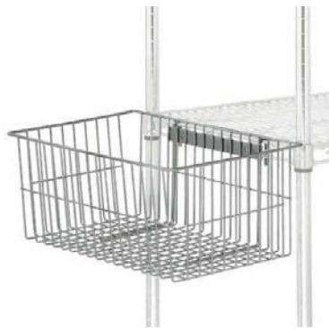
UB10 Utility Basket

Mounts under any size wire shelf and accepts keyboards up to 21"W x 11"D. Has a 6" height adjustment. Measures 25-1/4"W x 15"D x 4-1/4"H