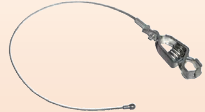
ESD-DC Drag Chain Drag chain is mounted to bottom of shelf and is used to ground standard wire shelving units. Recommended to be used in conjunction with aluminum or plastic conductive split sleeves.