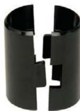
WR-SS Split Sleeve Sold as a pack of 4 pairs.