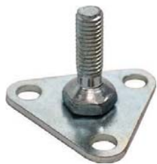
FP Foot Plate Triangular plate allows additional surface to disperse weight.