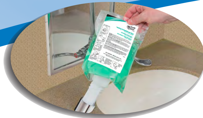
Insert bag into the refill dock so the soap flows ...