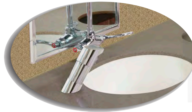
Replace the pump and you're ready to go!