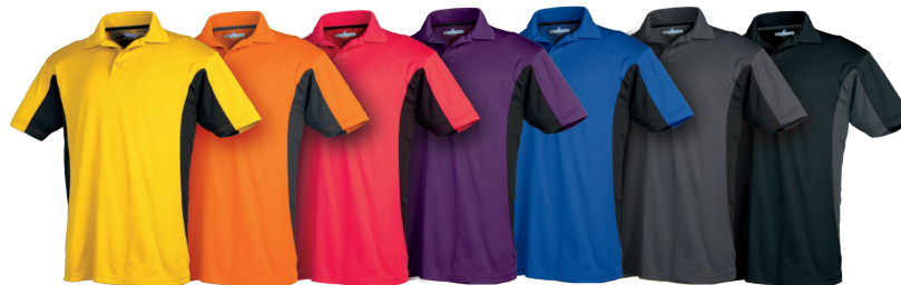
YELLOW/BLACK ORANGE/GRAPHITE RED/BLACK PURPLE/BLACK ROYAL/BLACK GRAPHITE/BLACK BLACK/GRAPHITE

For a shirt that won't sacrifice style for performance, look no further than this 4.2 oz. women's color block snag-resistant wicking polo. This fashion-forward item features BLU-X-DRI protection to keep you dry and comfortable no matter what the activity. It has stain-release technology, a taped neck and shoulder, hemmed cuffs, a rib-knit and curl-free collar, a tag-free label and contrasting side panels. It is available in seven colors and in sizes from S to 4XL.