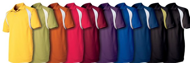
YELLOW/WHITE VEGAS GOLD/WHITE BURNT ORANGE/WHITE RED/WHITE BURGUNDY/WHITE PURPLE/WHITE ROYAL/WHITE NAVY/WHITE BLACK/VEGAS GOLD BLACK/WHITE

Perfect for the golf course, tennis court and much more, this men's 5 oz. short-sleeve raglan polo will keep you cool under pressure! Made of 100% polyester, this stylish item features advanced 3M Scotchgard moisture-wicking technology, which draws moisture from the skin to the surface of the shirt to keep your dry and comfortable. It has a curl-free collar, a V-neck placket with box-stitch detail, hemmed cuffs, shoulders, a straight bottom, side vents and pearlized buttons. Available in sizes from S to 6XL and in several colors, this popular polo will make a lasting impression.