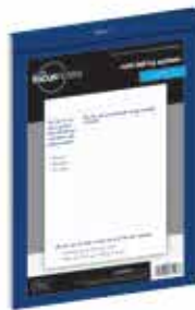
TOPS FocusNotes Legal Pad White, 50 Sheets 8½" x 11¾"

Notebook features a protective cover and spiral binding to keep notes under wraps — ideal for tucking into a briefcase or backpack. It's perfect for lectures and meetings, with superior 20 lb. paper that your pen will love.