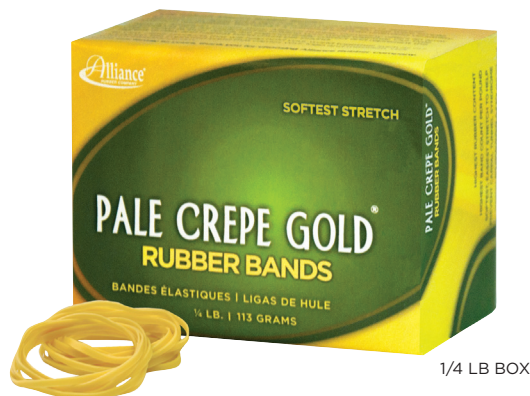
1/4 LB BOX

Pale Crepe Gold can help minimize workers comp expenses caused by repetitive banding. These bands put less stress on the hands and wrist and therefore can reduce the risk of Carpal Tunnel Syndrome or other trauma disorders.