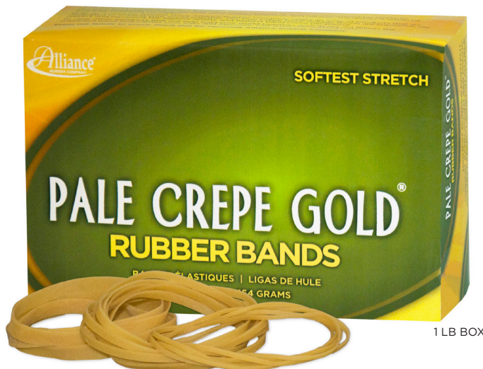
1 LB BOX