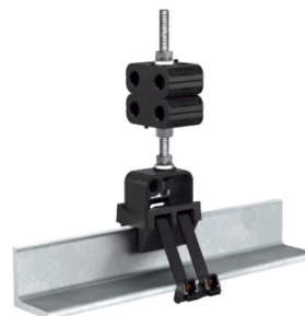
Threaded Rod Adapter with Universal Angle Adapter base 900639-10