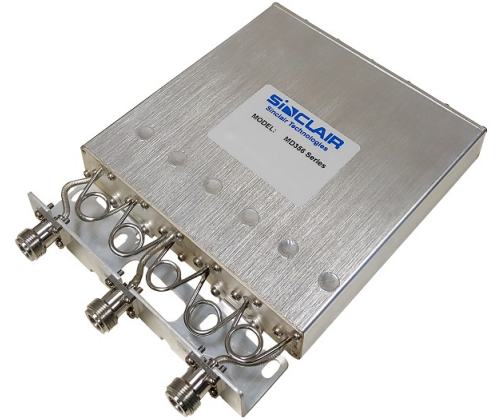
N female connector model shown. Image for illustration only and may not be an exact representation of product.

The Tx and Rx frequency separation available is 5 or 10 MHz. See below chart for detailed ordering information, and specify Tx and Rx frequencies when ordering. Other connector types are also available, please call for details.