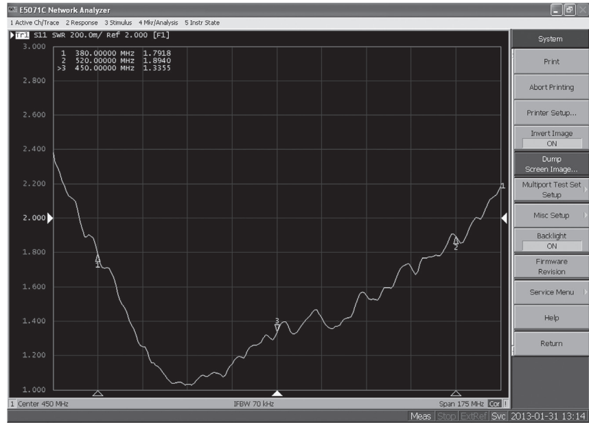
VSWR Plot (Measured on 2' x 2' GP)