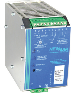
DIN-UPS 12-10 (Case Size A)