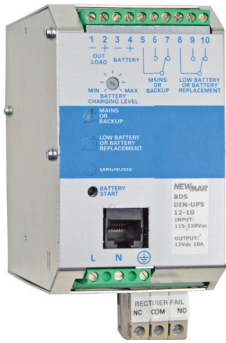
BDS-DIN-UPS 12-10 (Case A)

Powers Loads, Charges and Monitors Back-Up Battery, Meets NFPA 1221 Alarm Requirements