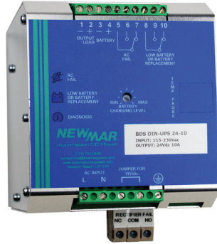
BDS-DIN-UPS 24-10 (Case Size B)