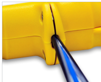
Precision blades easily cut through jacket without damaging fiber.