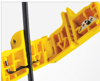
Hinged design opens to accept cable for end and mid-span applications without disassembling tool.