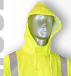
Detachable Hood (Included with Jacket and Coat)