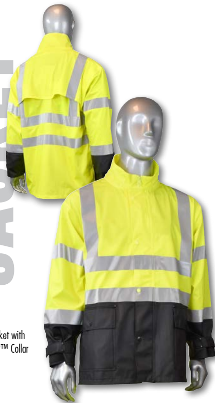
Jacket with ETP™ Collar