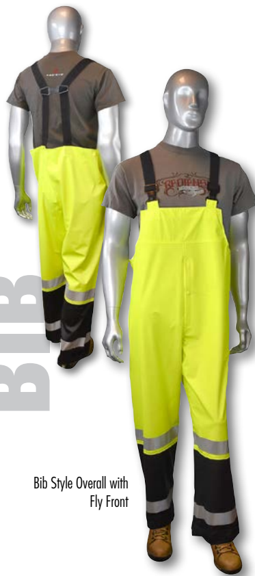
Bib Style Overall with Fly Front