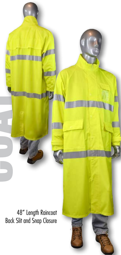
48" Length Raincoat Back Slit and Snap Closure