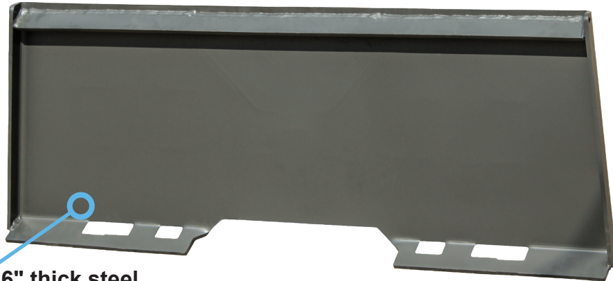
Plate mounts easily to skid steers that use the standard universal quick attachment.