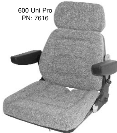
600 Uni Pro PN: 7616