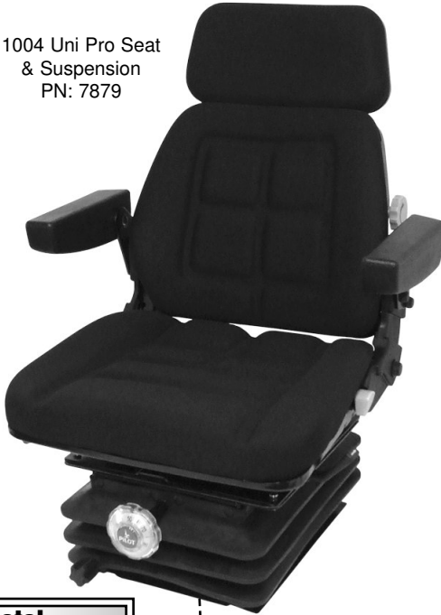
1004 Uni Pro Seat & Suspension PN: 7879