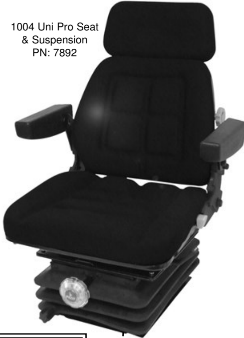
1004 Uni Pro Seat & Suspension PN: 7892