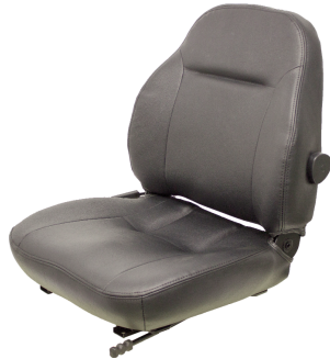
441 Uni Pro Black Vinyl PN: 8021