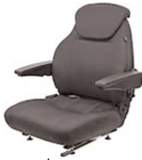
440 Uni Pro Black Fabric PN: 8014