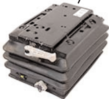
KM MSG83 Mechanical Suspension PN: 8079