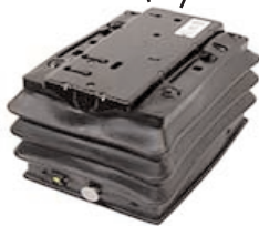
KM MSG93 Air Suspension PN: 8080