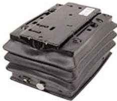
KM MSG93 Air Suspension PN: 8080