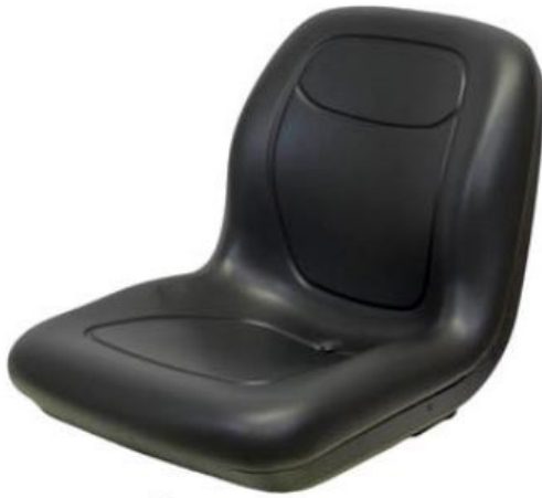
KM 125 PN: 7937