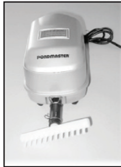
AP-40 with included air diffuser and short hose section