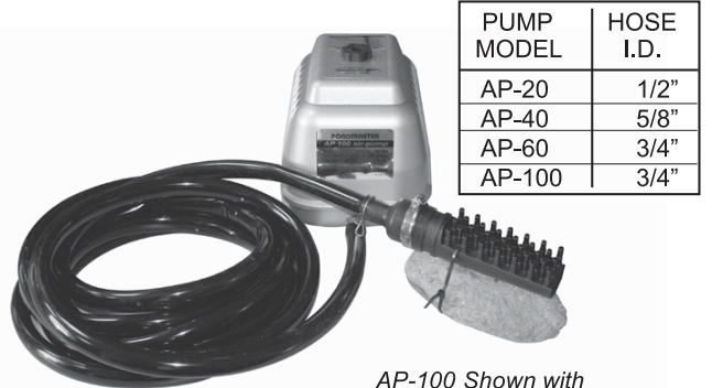
AP-100 Shown with added hose and included diffuser