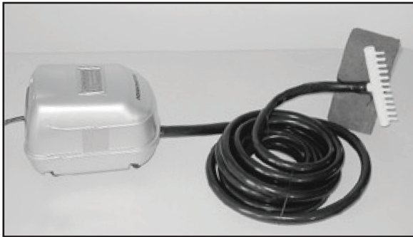
AP-40 with an added hose section and included air diffuser