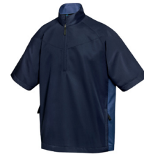
Navy/ Mountain Blue