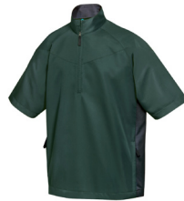
Forest Green/ Black