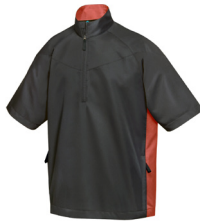
Charcoal/ Burnt Orange