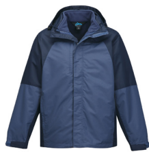
Mountain Blue/ Navy